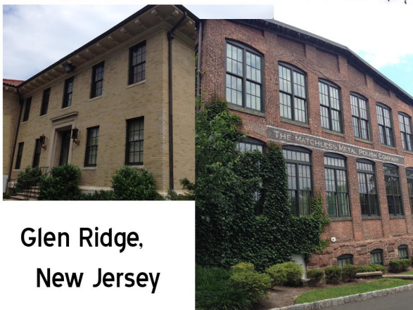
Glen Ridge, New Jersey